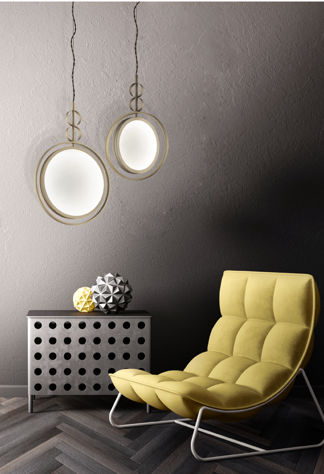
Girasole 40 | 30